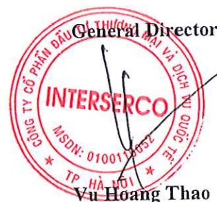
Vu Hoang Thao