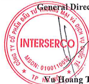
Vu Hoang Thao