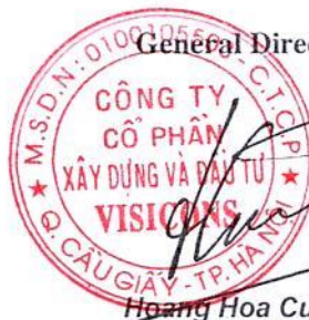
Hoang Hoa Cuong