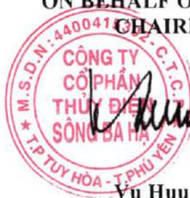
Vu Huu Phuc