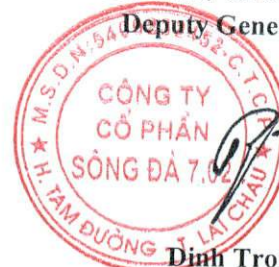
Dinh Trong The