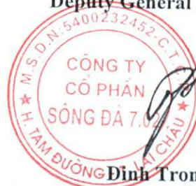
Đinh Trọng The