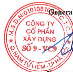
Nguyen Van Oanh