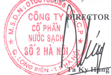
Ta Ky Hung