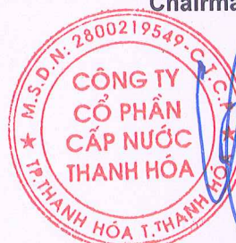
Le The Son