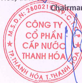
Le The Son