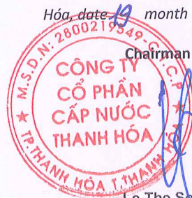
Le The Son