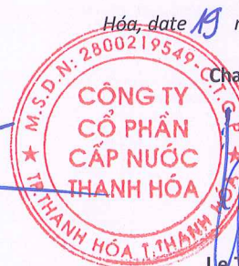
Le The Son