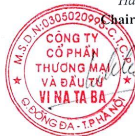
LE CHI LONG