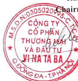
LE CHI LONG