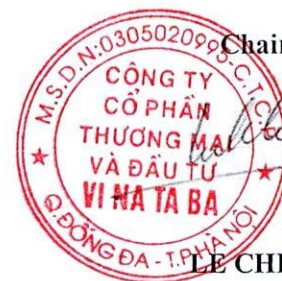
LE CHI LONG