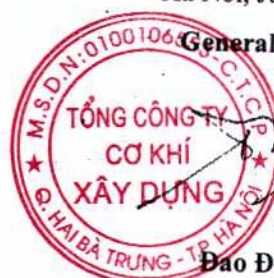
Đào Đức Thọ