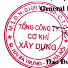
Đào Đức Thọ