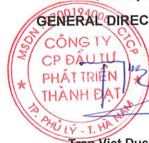
Tran Viet Duc