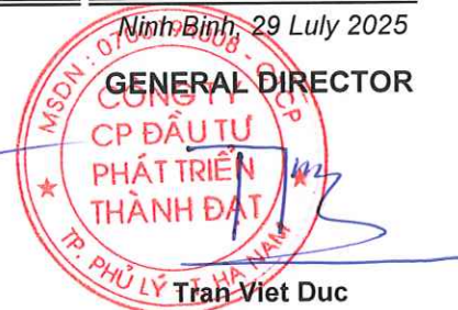
Tran Viet Duc