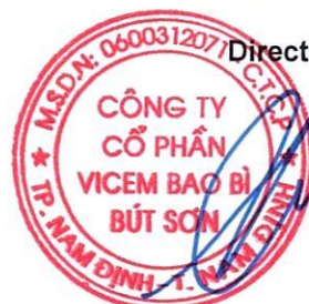
Tran Ngoc Hung