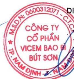
Tran Ngoc Hung