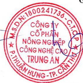
NGUYEN LE BAO TRANG