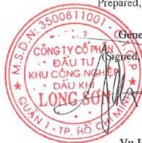
Vu Hoang Long