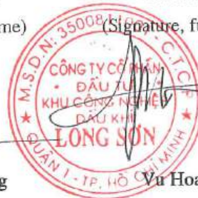
Vu Hoang Long