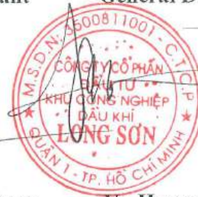
Vu Hoang Long