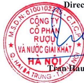
Tran Hau Cuong