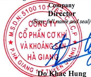
Do Khắc Hưng