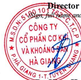
Đỗ Khắc Hưng