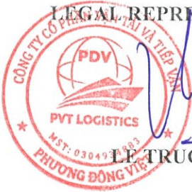
LE TRUC LAM