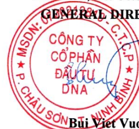
Bui Viet Vuong