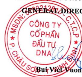
Bui Viet Vuong