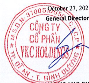
PHAM HOANG PHONG