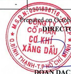
ĐOÀN DẠC HỌC