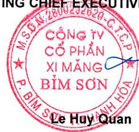
Le Huy Quan