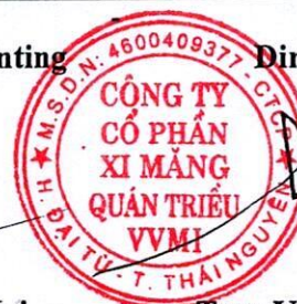
Tran Viet Cuong