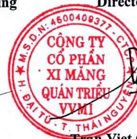
Tran Viet Cuong