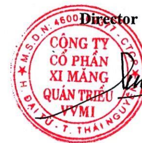
Tran Viet Cuong