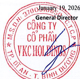
PHAM HOANG PHONG