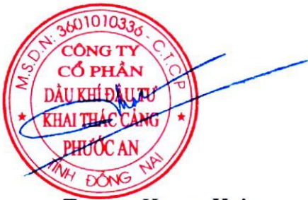
Truong Hoang Hai