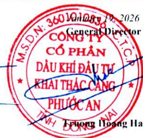
Truong Hoang Hai