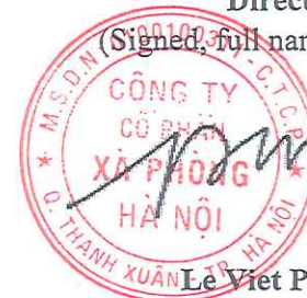
Le Viet Phuong