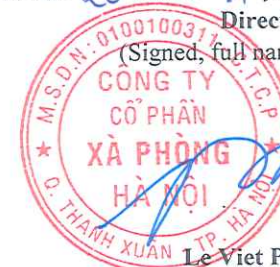
Le Viet Phuong