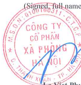
Le Viet Phuong