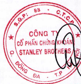
HO LE VIET HUNG