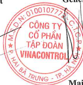
Mai Tien Dung