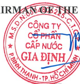
Hoang The Bao