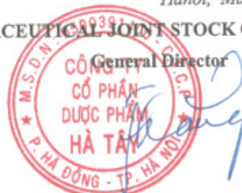
Le Xuan Thang

(Notes from page 10 to page 41 are an integral part of these Separate Financial Statements)