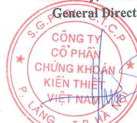
Hoang Xuan Hung