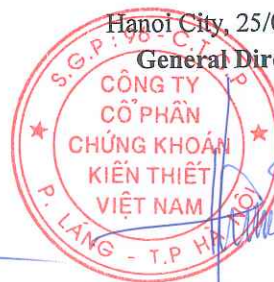
Hoang Xuan Hung