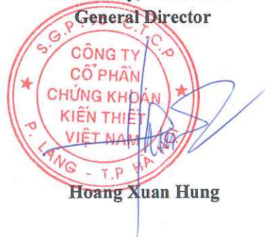
Hoang Xuan Hung