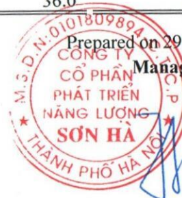
Tran Ngoc Hung